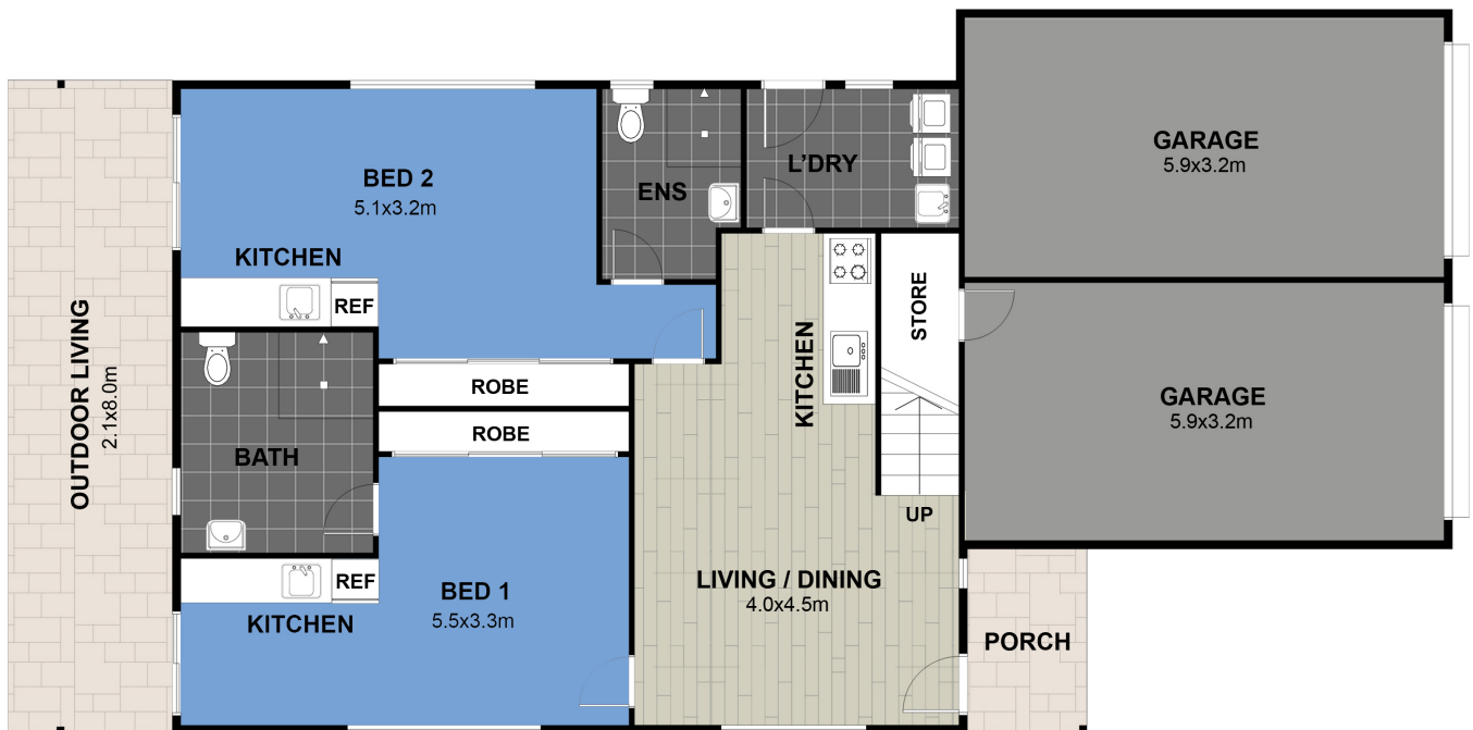
LOWER LEVEL PLAN

* Subject to orientation and fall of land, and developer and council guidelines. Traditional floorplan shown.