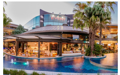
Westfield Garden City shopping centre